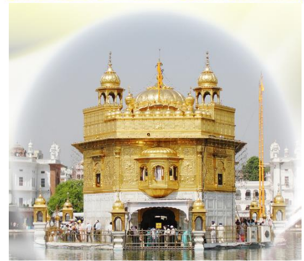
Sri Darbar Sahib (Golden Temple) Amritsar, INDIA